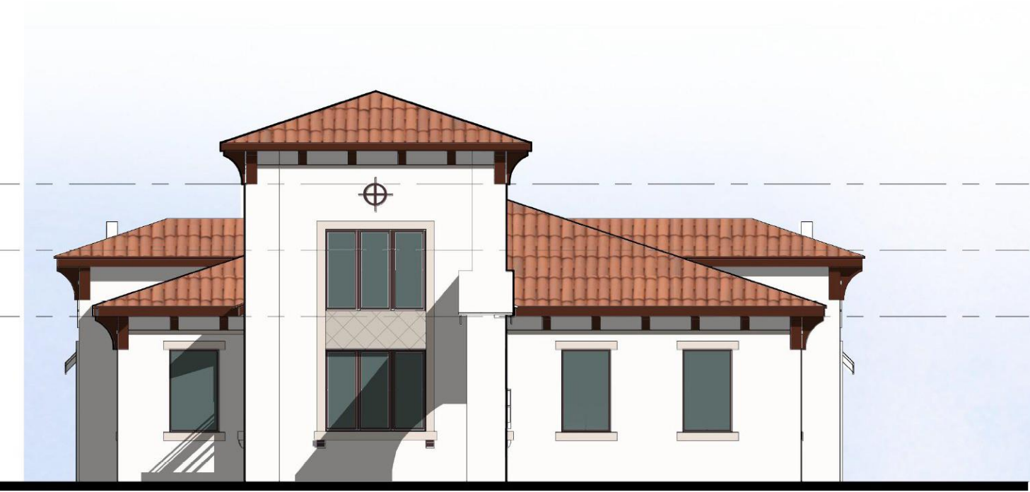
3. ELEVATION 3 1/8" = 1'-0"