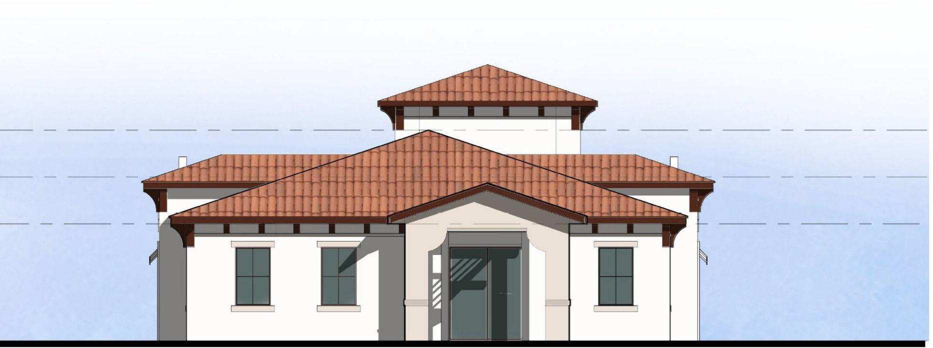
4. ELEVATION 4 1/8" = 1'-0"