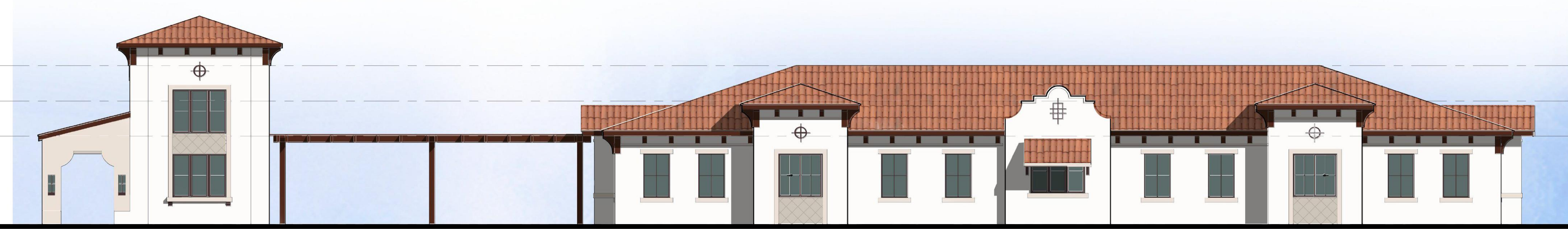
1. ELEVATION 1 1/8" = 1'-0"