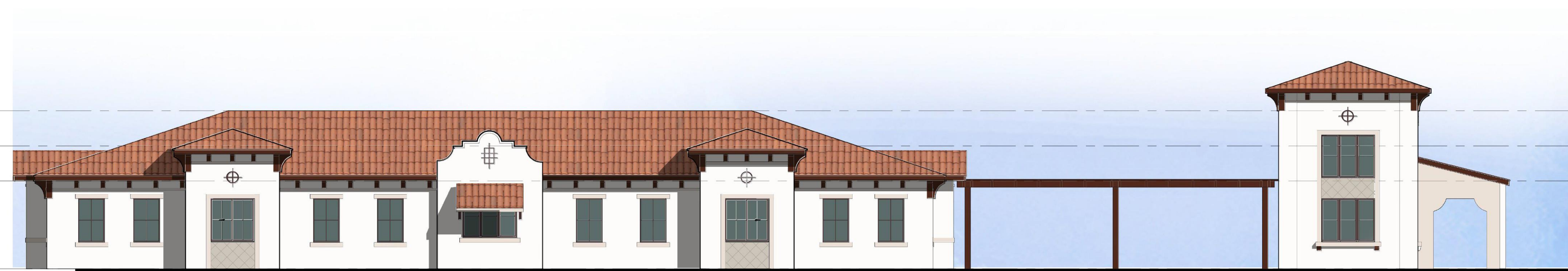
2. ELEVATION 2 1/8" = 1'-0"